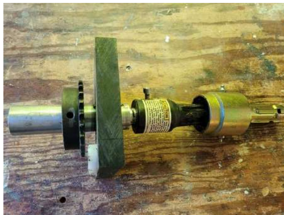
Overrunning clutch and bearing assembly

In addition, the overrun clutch assembly at the top of the shaft froze. This assembly prevents the inertia of the rotating shaft from tearing loose the drive mechanism when the gear motor is shut off.