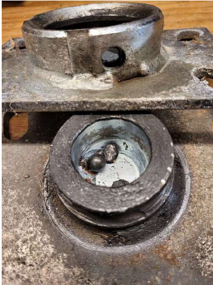
Damaged support bearing

Notice, in the photo below, the hole and some of the damaged balls inside the bearing.